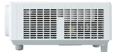
Left Side Profile